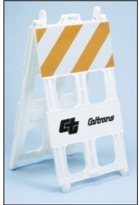
Sturdy, cross-member reinforced design with holes and slots for easy sign attachment.