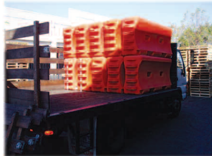
Water-Wall stacks for storage and transportation.