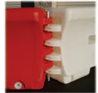
Water-Wall can pivot 30-degrees and be locked together with steel connection pins.