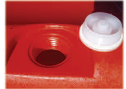
New tamper resistant, corner offset drain plug with coarse buttress thread — screws in or out in only 2 1/2 turns.